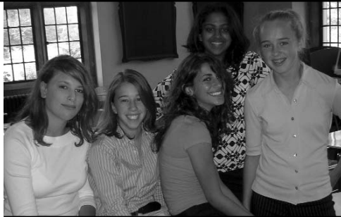
Freshmen taking a break from their studies to make new friends.