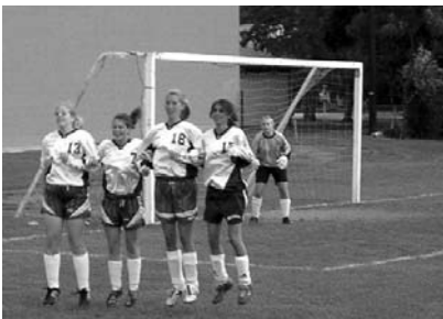
Girls' J.V. Soccer stands to block a kick.