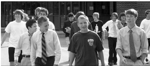
P.E. Warriors returning from battle.

As for the sports teams, maybe varsity football and freshman soccer isn't doing that well, but the other teams aren't that bad at all. Varsity field hockey hasn't lost a game yet and neither has boys' varsity soccer. JV boys soccer, field hockey, girls varsity soccer, and girls tennis have only lost once so far and the rest of the sports teams aren't doing badly either.